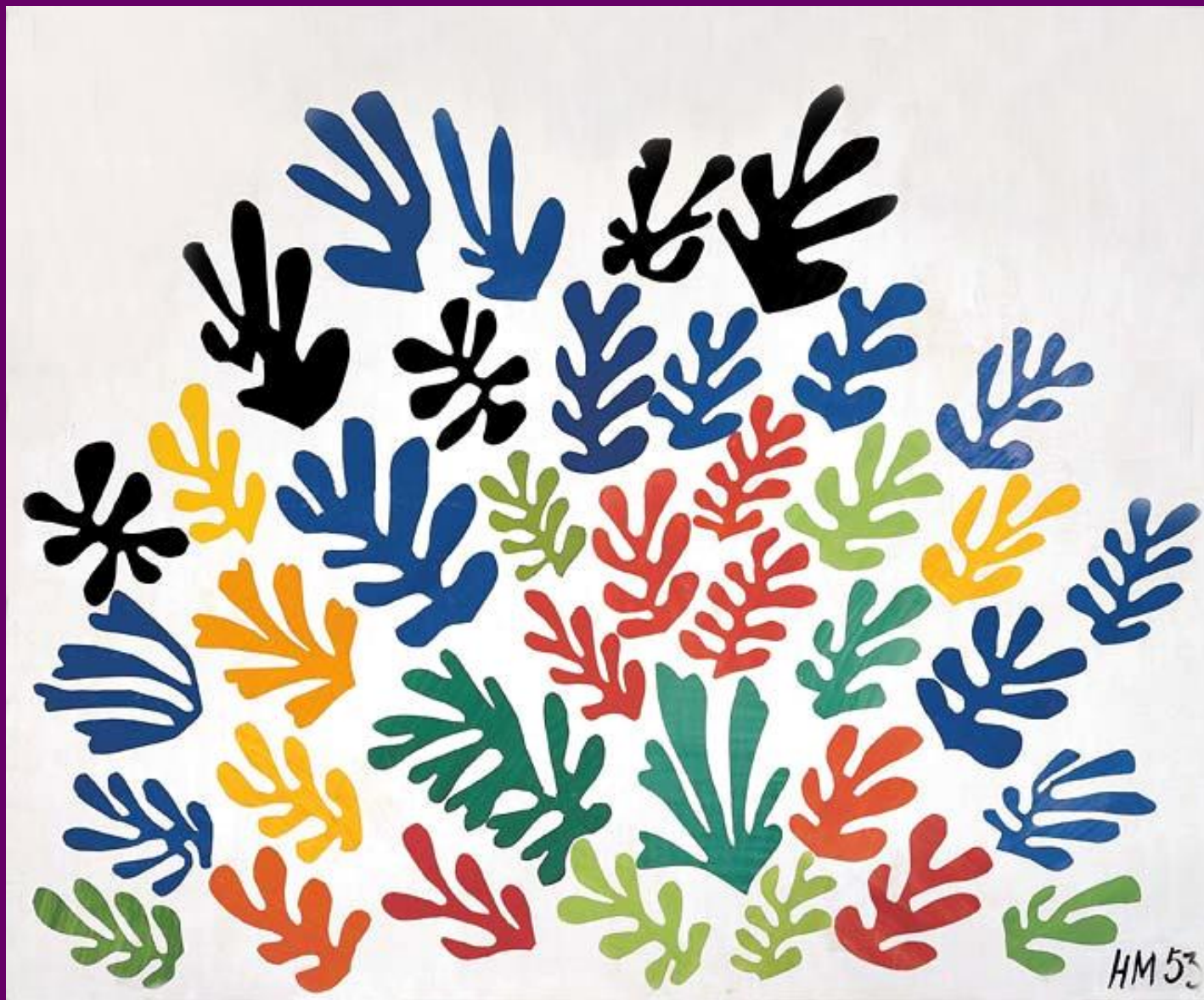
La Gerbe, 1953