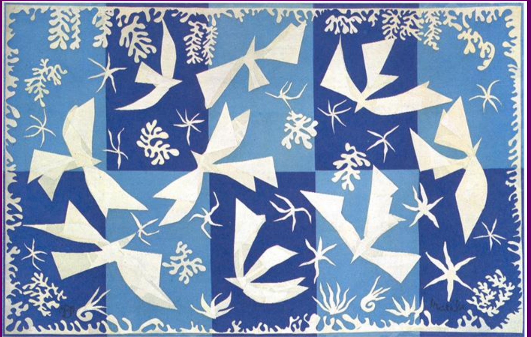
Polinesia, The Sky, 1947