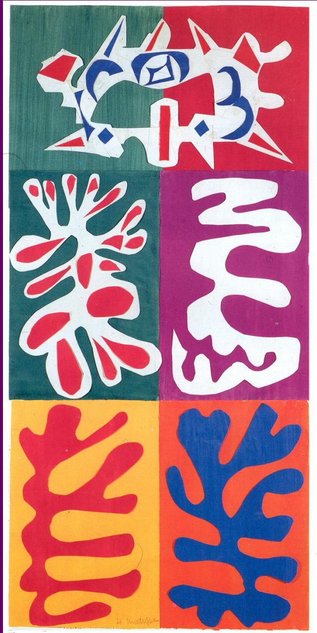
Panel with mask, 1947