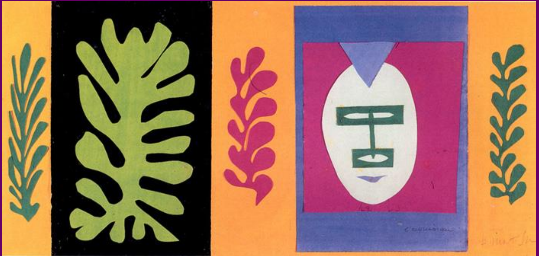
The Eschimo, 1947