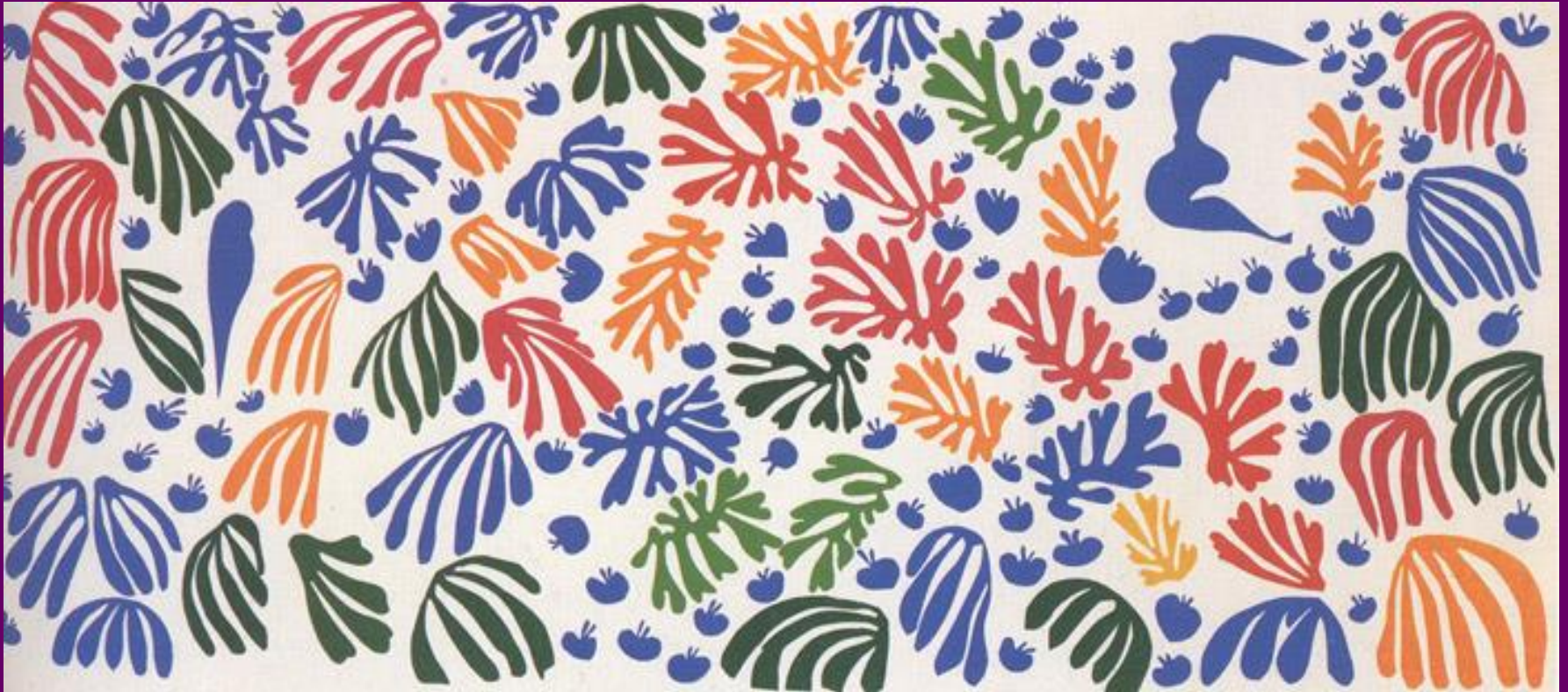
La Perruche et la sirène, 1952