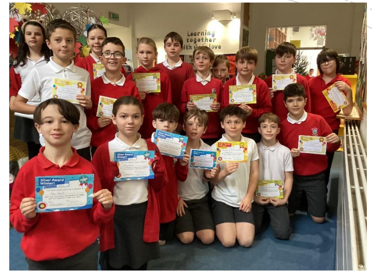
Well done to the children who took part in the Primary Maths Challenge and achieved great results!