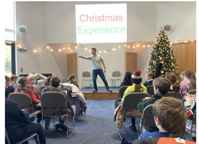
Christmas Experience at the Baptist Church