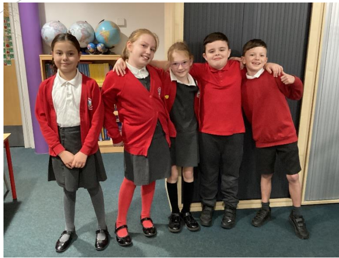
Sussex Radio – some Year 4 children took part in 'Small Talk' – where they had to describe objects and places without saying the actual word!