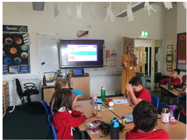
Pine Class learning about digital safety in PHSE