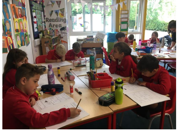
Lime Class learning about place value up to 1,000