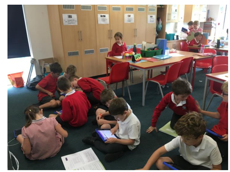
Maple and Oak Classes practising "Times Tables Rockstars"