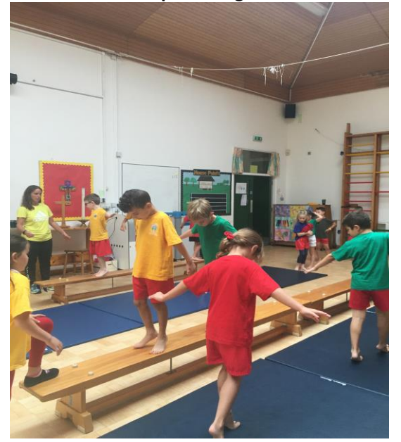
Elder Class balancing, moving backwards in PE