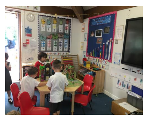
The Reception staff team are impressed with how well the new Reception are doing!