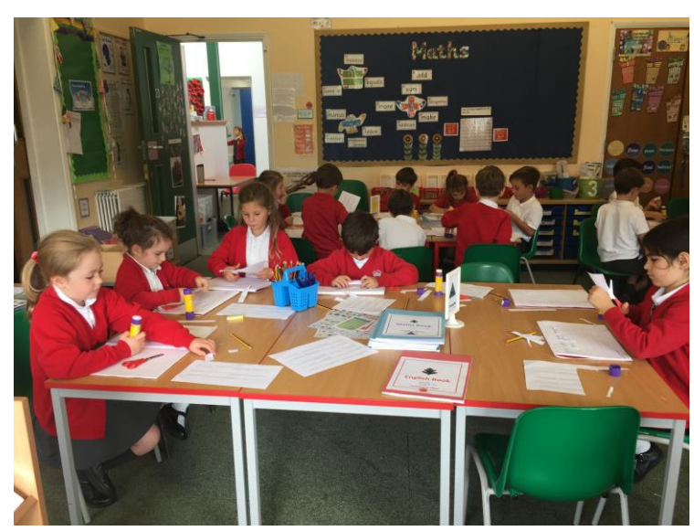
Hawthorn Class classifying facts about penguins