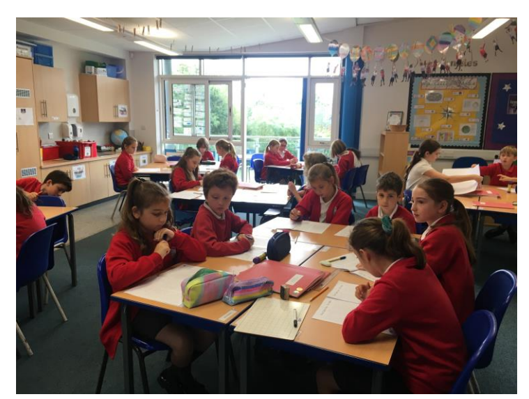
Rowan Class completing their times tables assessments