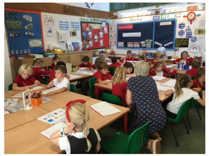
Damson Class practising "one more than" in maths