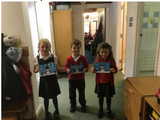
Chestnut's beautiful Christmas cards