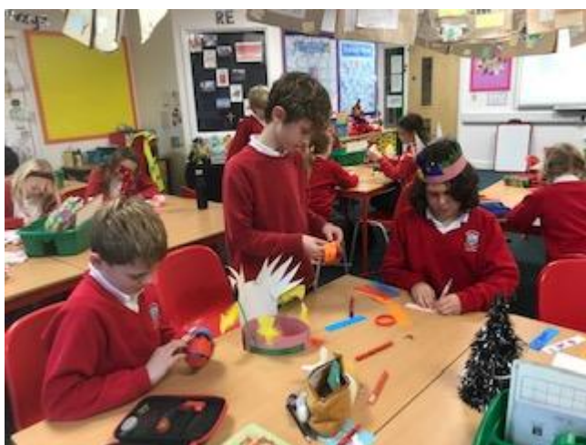
Pine making intricate paper baubles