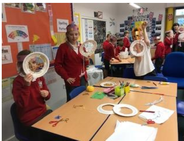
Silver Birch making dream catchers