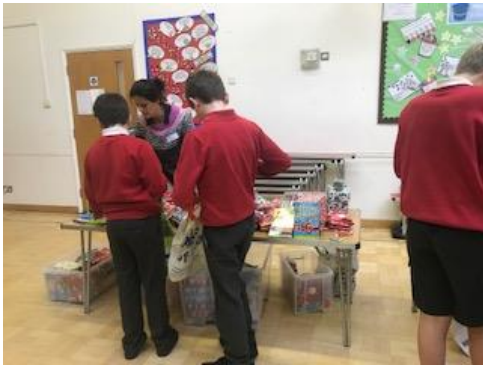
Finding the gift list!

Thank you to our amazing PTA, who again ran an extremely well organised and exciting shopping day for our children. So many parents gave up their time to help run the Christmas shop and the variety of gifts on offer was vast!