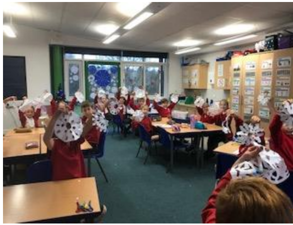
Oak children making paper snowflakes