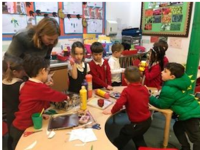
Ash children printing stars, tress and baubles with paint