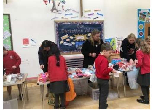
So many things to choose from!