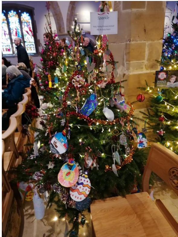
Holy Trinity Primary Early Years & KS1 “ Sparkle Tree”