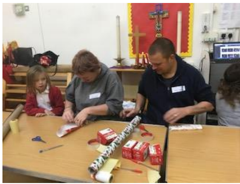
Wrapping hundreds of gifts!