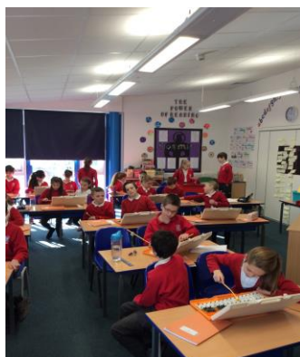
Silver Birch playing tuned percussion instruments