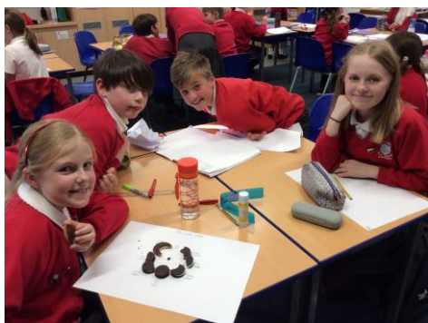
Children learning about the lunar calendar with Oreo biscuits