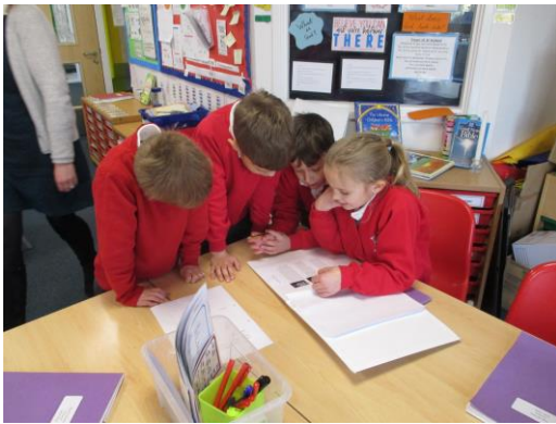
Lime Class investigating how light travels in science.