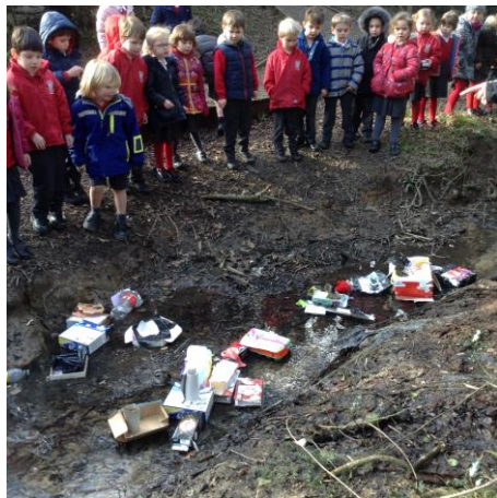
Reception children floating boats

Reception children have been designing and making boats for Sailor Bear. In the morning the children drew our own designs - thinking about what they'd learned last term in their floating/ sinking and waterproof materials experiments. The children then worked in groups to build their own boat out of the junk modelling and other materials. Once the boats were built the children took them down to the stream to see if they would float and were really pleased because they all did!