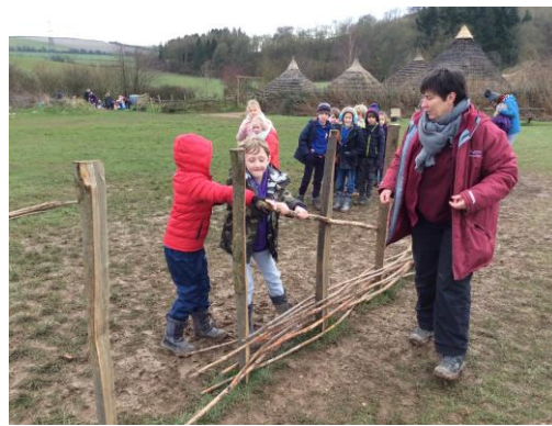
Juniper Class at Butser Farm weaving a wooden fence.