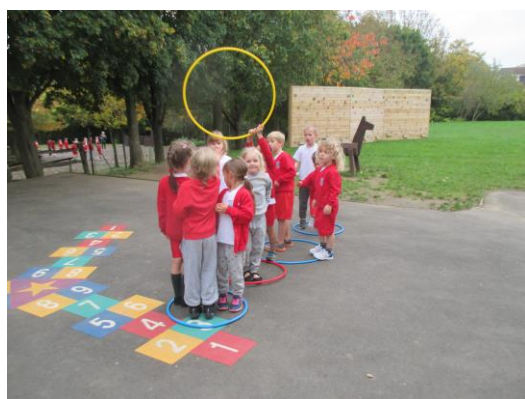
Damson Class working together as a team