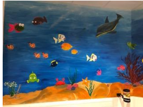
Under the Sea!

Open Afternoon – We will be holding our Open Afternoon at 2.15pm until 4.00pm on Wednesday 14 th March . We welcome parents or grandparents coming into school to look at their child / grandchild's work with them. Our children really enjoy showing off what they have achieved during the term! All children are expected to leave at 3.15pm our usual finish to the day. Please note this is not a time when teachers will be available to discuss your child or their progress with you, as they are busy supervising the children.