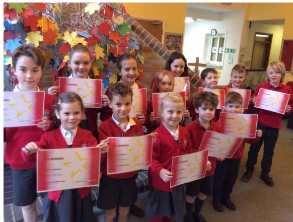
Holy Trinity CE Primary Star Writers