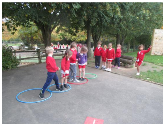
Chestnut Class problem solving in PE