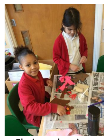
Glueing and sewing