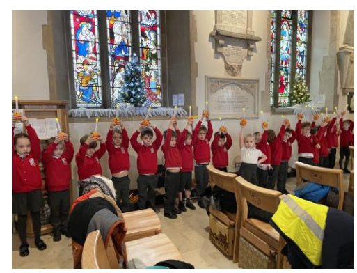
Key Stage 2 Christingle Service