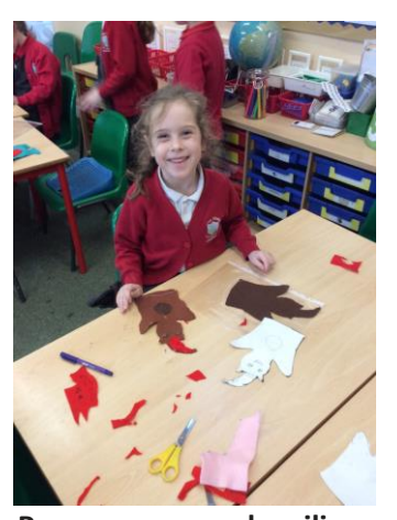
Perseverance and resilience