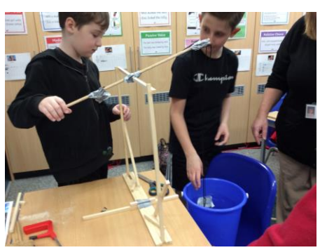
Reviewing and reshaping the shaduf