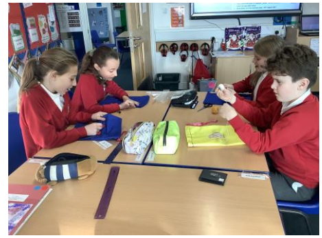
Concentrating hard on sewing skills