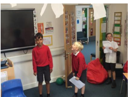
Immersion in playscripts