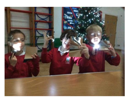
Learning about light