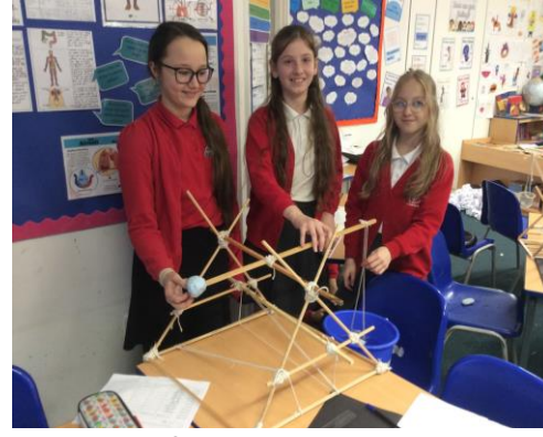
The finished article!