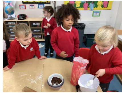
Weighing out ingredients