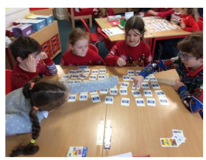
Learning times tables