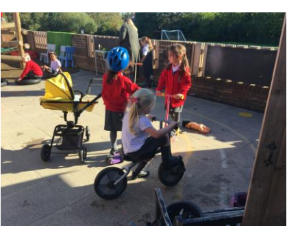
Developing gross motor skills