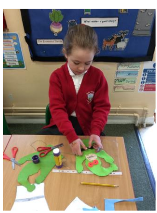
Pride in our work