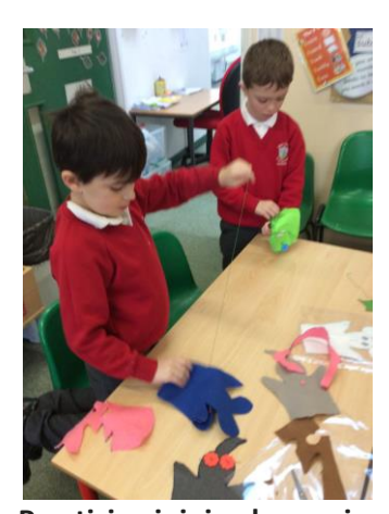
Practising joining by sewing