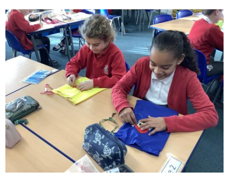
All smiles, as the bags take shape