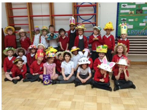
Damson show off their Easter Bonnets and Hats!