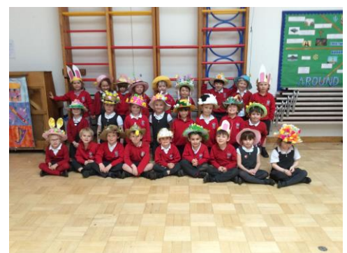
Ash Class wore their hats proudly!