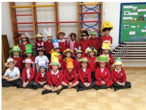
Hawthorn's Easter Bonnets and Hats!

Easter Bonnets and Hats – The creativity of the Easter Bonnets and Hats worn by our children to school was fantastic. Thank you for all the effort you have put into helping your child make their bonnet or hat. We all enjoyed seeing them wear them to their Easter Service.