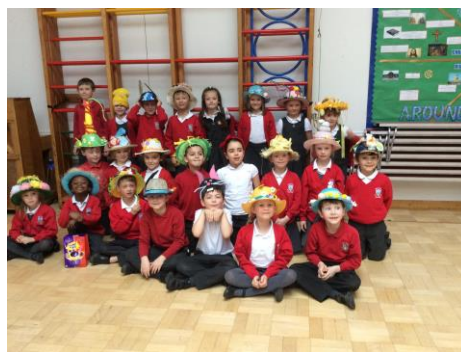
Where did you get those hats Elder?