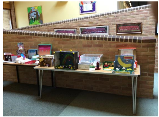
From Dinosaur Eggsploration to Eggie the Eagle!