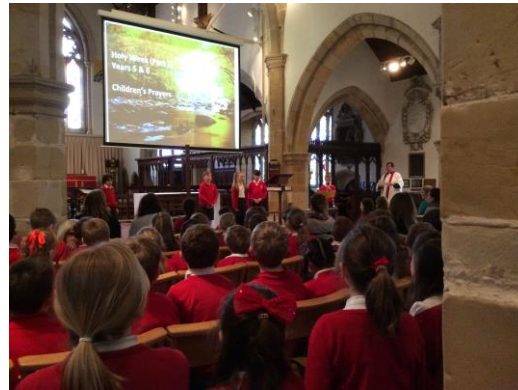
Year 3,4,5 & 6 Easter Service

Easter Bonnets and Hats – The creativity of the Easter Bonnets and Hats worn by our children to school was fantastic. Thank you for all the effort you have put into helping your child make their bonnet or hat. We all enjoyed seeing them wear them to their Easter Service.