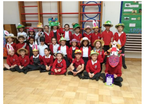
Chestnut's Easter parade!