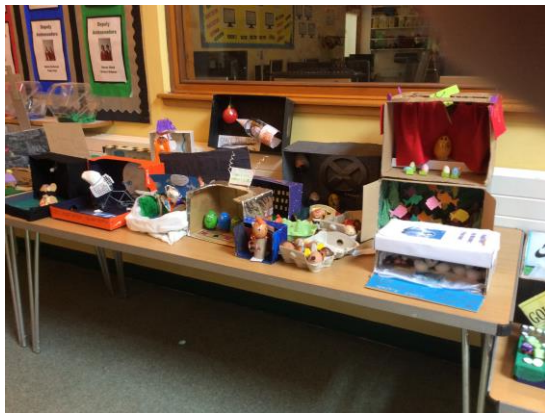
From ET to Space Eggsplorer!

Eggs for Extravaganza – Congratulations to the many entries for the junior Eggs for Eggstravaganza entries! The children really thought outside the box and came up with some amazingly, creative and effective ideas. The detail included was also impressive!