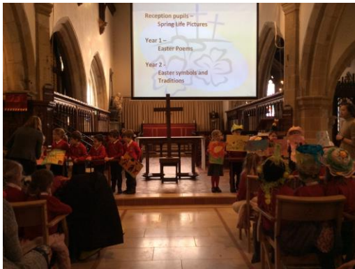
Reception, Year 1 & 2 Easter Service

Easter Services – I would like to congratulate our children for the two wonderful Easter services held on the last day of term. The children yet again surpassed themselves with their singing, dramatic performances, prayers and paintings. It was lovely to see so many parents and grandparents join us for the Services (some of you for both Services!) and I know you all enjoyed listening and watching our children take part in the Service.