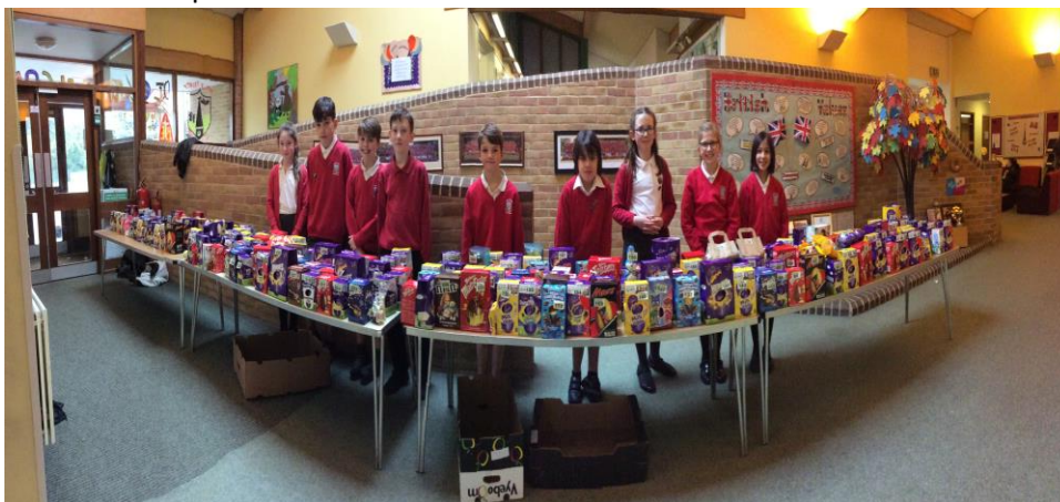
Easter Eggs galore!

Easter Egg Tombola - The children enjoyed visiting our Easter Egg Tombola on the last afternoon of term. A Huge thank you to the Ambassadors, who really helped our younger children find the right Easter egg which matched their ticket. They were all very kind, helpful and supportive to their peers.