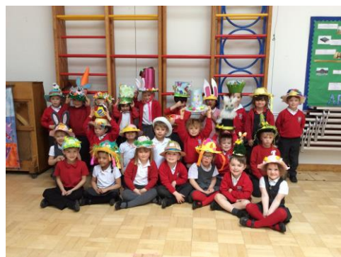
Hats off to Beech Class!