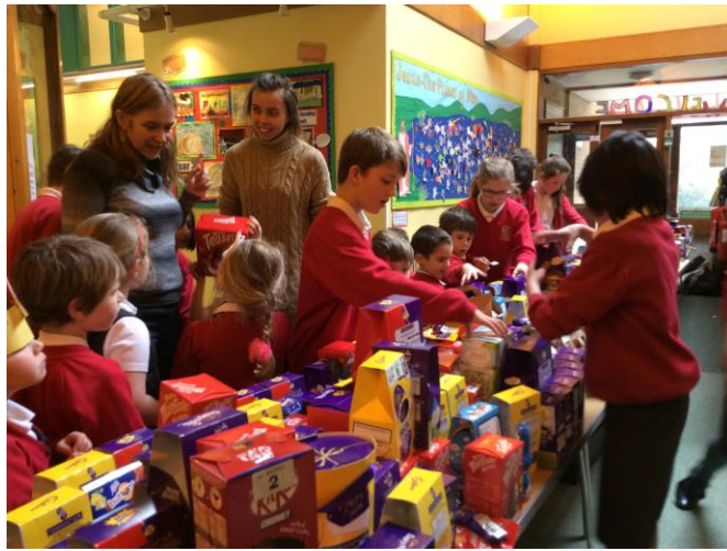
Reception children were very pleased to receive an egg!

All money received from the Easter Egg Tombola will go towards a treat for all the children at the end of the Summer Term for their hard work over the year!