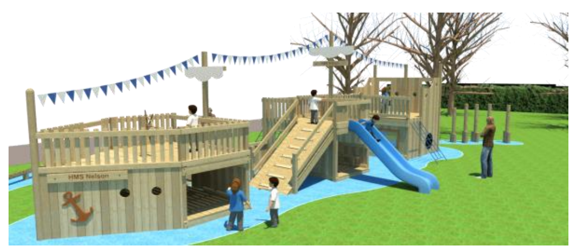
Reception & KS1 Play ship to be installed in July similar to ours!