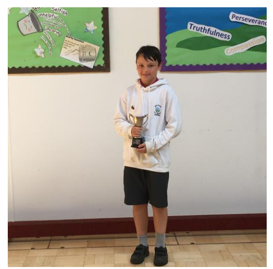
Aspiration Cup -