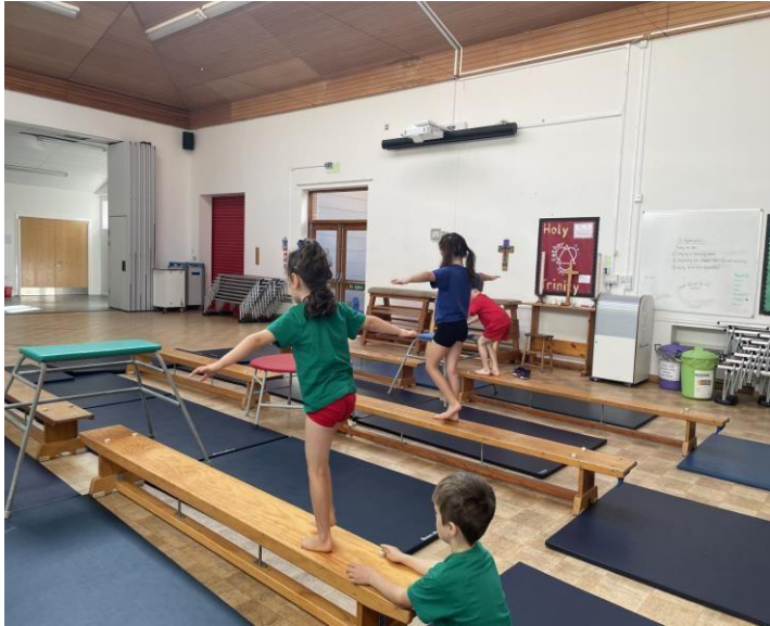
Elder Class practicing balancing, moving backwards and jumping in PE geography