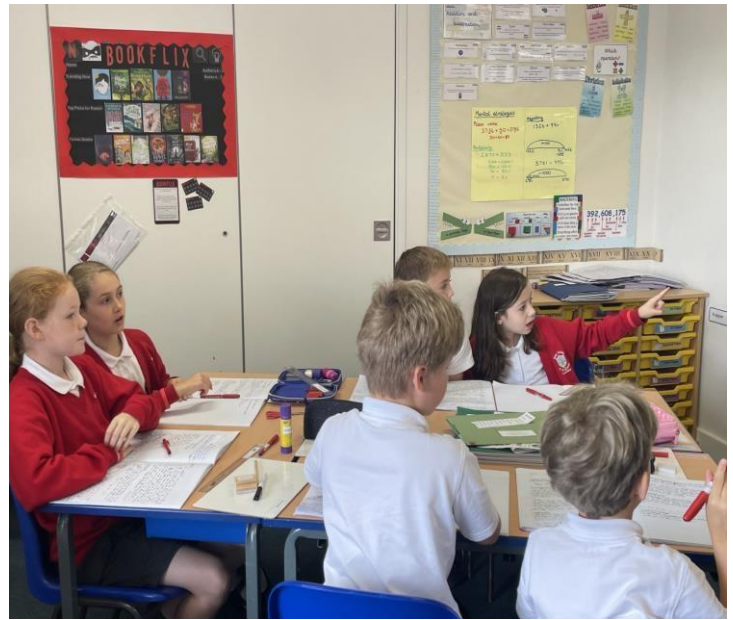
Rowan Class working together to find the missing word, so the sentence makes sense Year 2