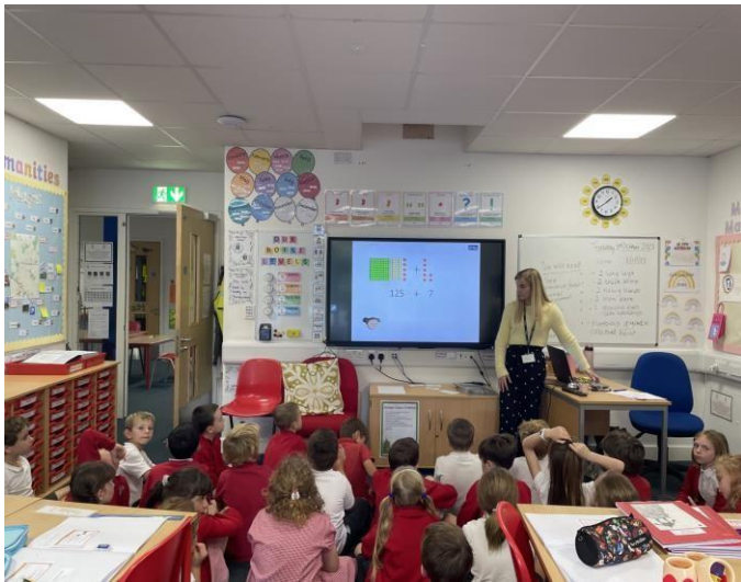
Juniper Class are learning to add, bridging the tens Year 1