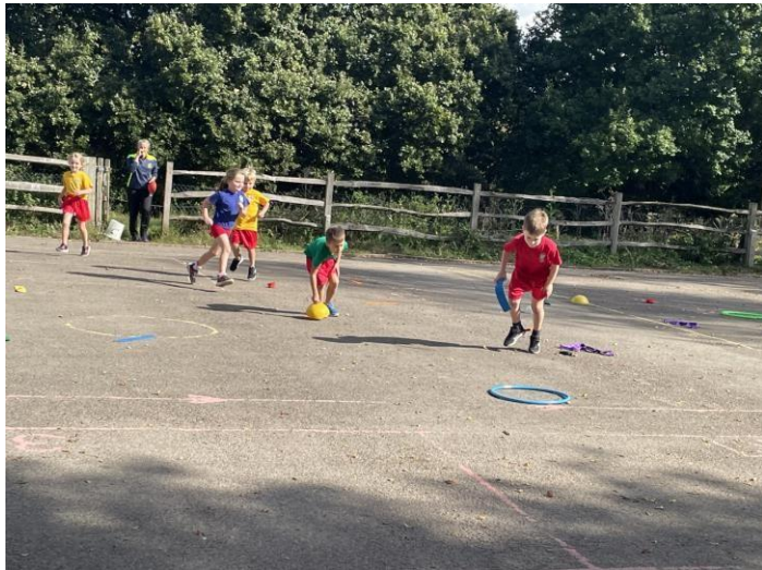
Damson Class are finding objects in PE to match a picture to them.