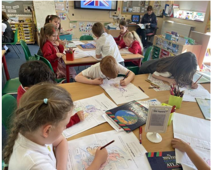
Hawthorn learned about the countries in the UK last week and are discovering the capital cities of those countries this week in

Reception children are settling in, getting used to school routines and working with old and new friends. The children have been completing their Baseline Assessments and starting to learn their phonic sounds.