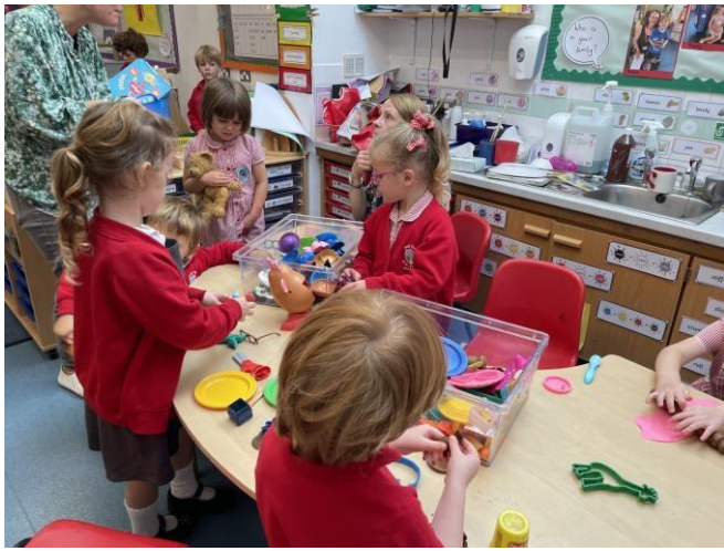
Reception are certainly busy bees!