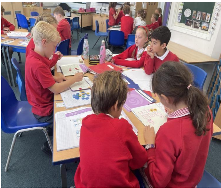
Pine Class using mathematical resources to explain their thinking