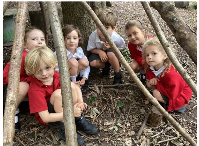
Chestnut Class are enjoying being in our woods! shown

Year 4 - Year 4 had an amazing school visit to Woods Mill! They are learning about classification of animals-vertebrates/ invertebrates, as well as enjoying lots of other 'hands on' tasks.