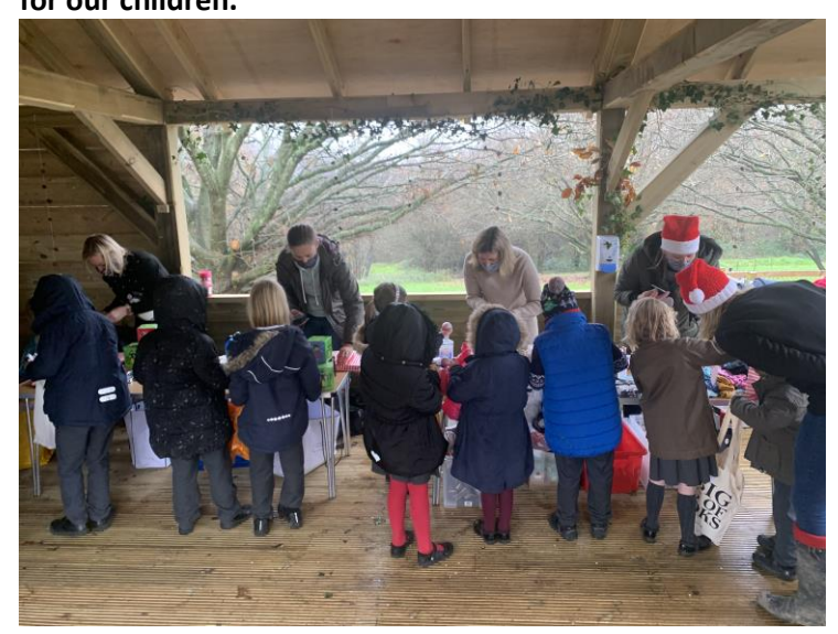
Christmas Shopping Day was another resounding success! Thank you again PTA for giving up your time to organise and run it for our children.