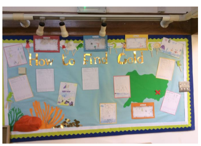
Year 1 have worked hard with their writing.