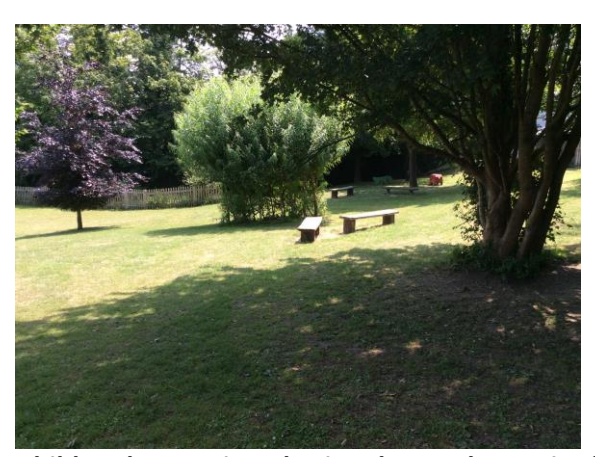
Children have enjoyed using the newly repaired seats.