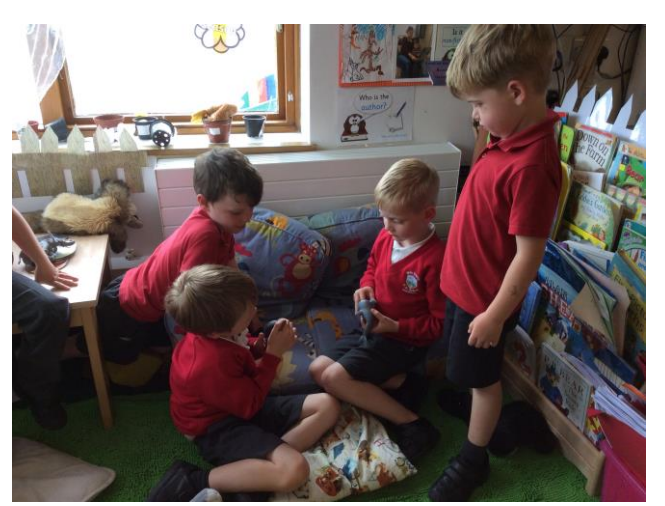
Boys from Beech Class enjoying looking at model animals.

The children are enjoying looking at the caterpillars as they change into a chrysalis. They have enjoyed touching and looking at our range of model insects, bugs and mini-beasts. They have looked at odds and evens and repeated patterns in maths. The children have drawn their own insect, mini beast and written labels for the body parts. In PE the children have practised for Sports morning.