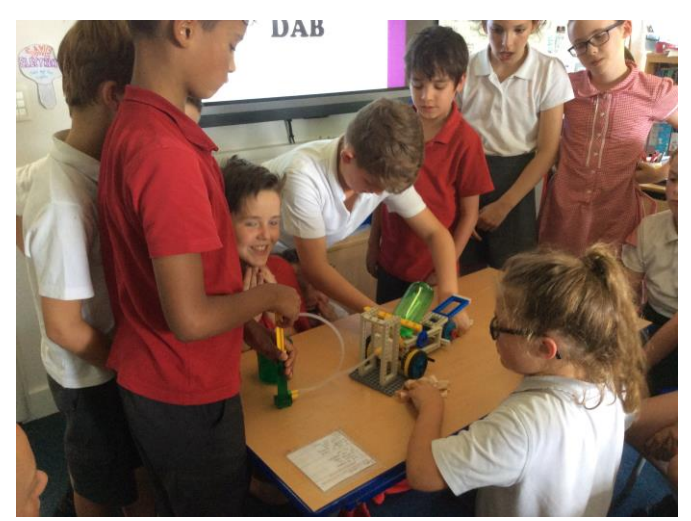
Silver Birch investigating their air and water rocket

This week Year 5 / 6 have thoroughly enjoyed building electrical games / toys ready for a Dragon's Den presentation. They have painted water colour meadow scenes and used charcoal to demonstrate perspective in art. In maths the focus has been on algebra. The children have played rounders and cricket in PE lessons. They have worked hard at writing their own group "Varmint" poem and performed them. In DT air and water rockets have been built.