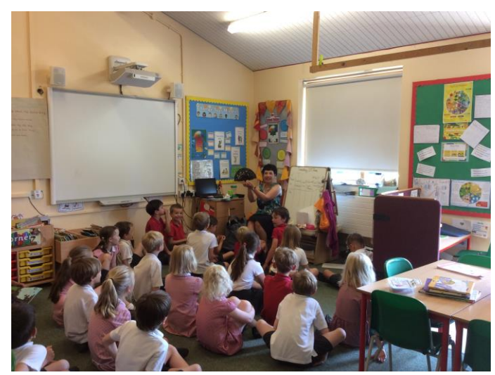
Hawthorn Class practising their French.