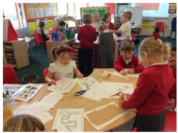
Reception children working independently