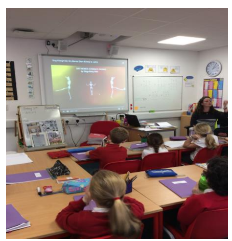
Juniper Class measuring and looking at bones in science