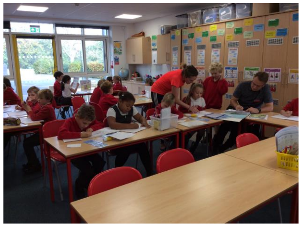
Lime Class concentrating on their science work