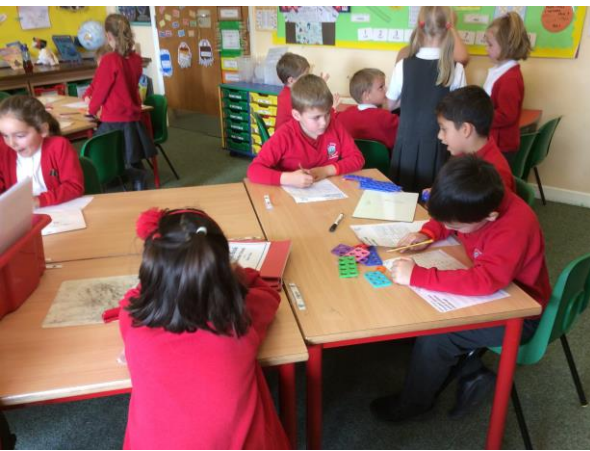
Elder Class using numicon to consolidate their understanding of maths