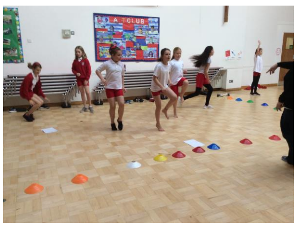
Willow Class enjoying a dance lesson