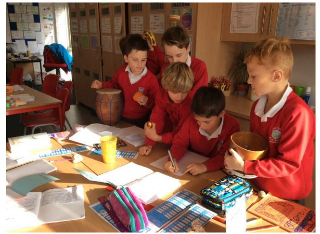
Oak Class creating their own Sea Monkeys chant accompanied by percussion instruments