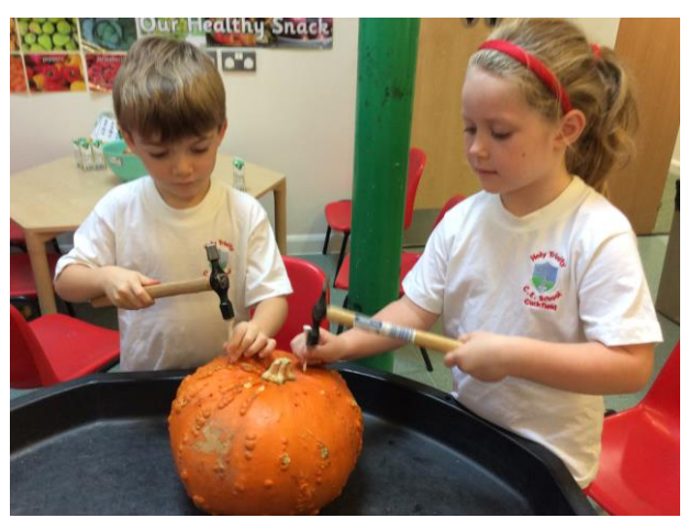
Reception children developing their hand eye co-ordination Hammering golf tees into a pumpkin