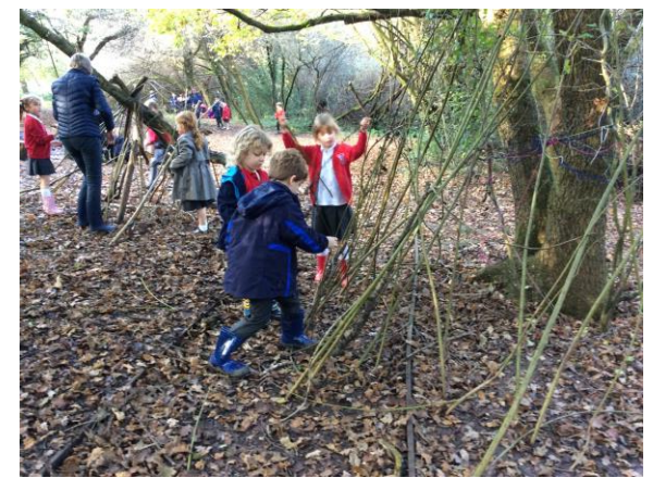
Year 1 making a Sukkah used for the Jewish Festival of Sukkot