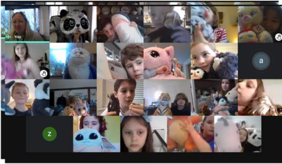
Bring a soft toy to school