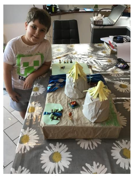
George's round houses