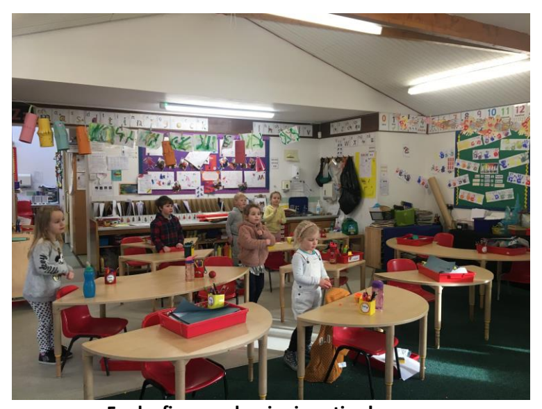
Funky fingers phonics in action!