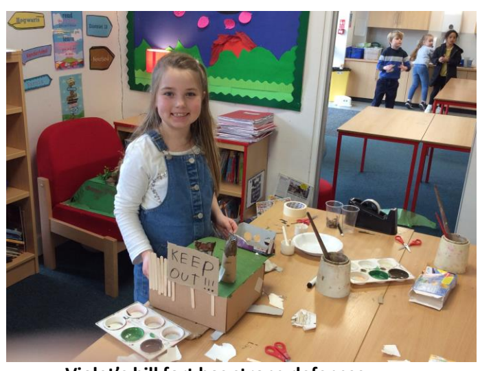
Violet's hill fort has strong defences