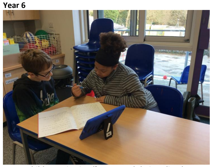
Year 6 children using iPad's to record their radio play