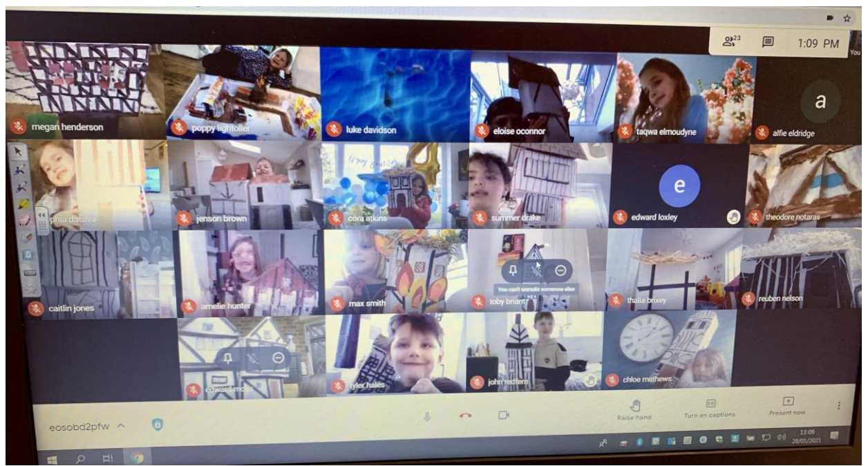
The children made some wonderful houses for The Great Fire of London!