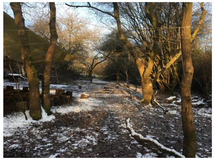
I wonder if the children can say where these places are in school?