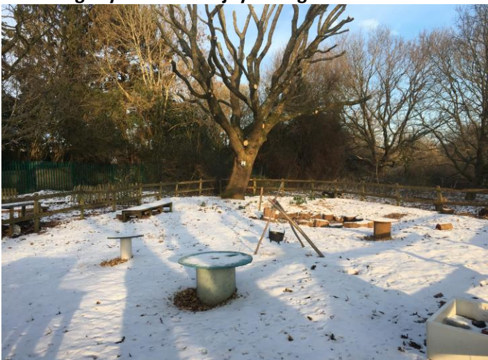
We thought you would enjoy seeing some of our beautiful grounds in the winter!