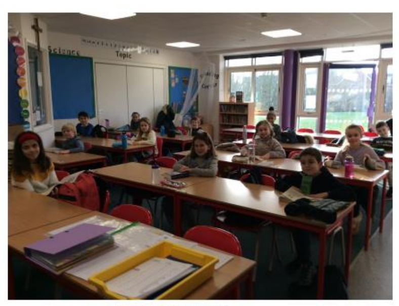
Year 4 key worker children