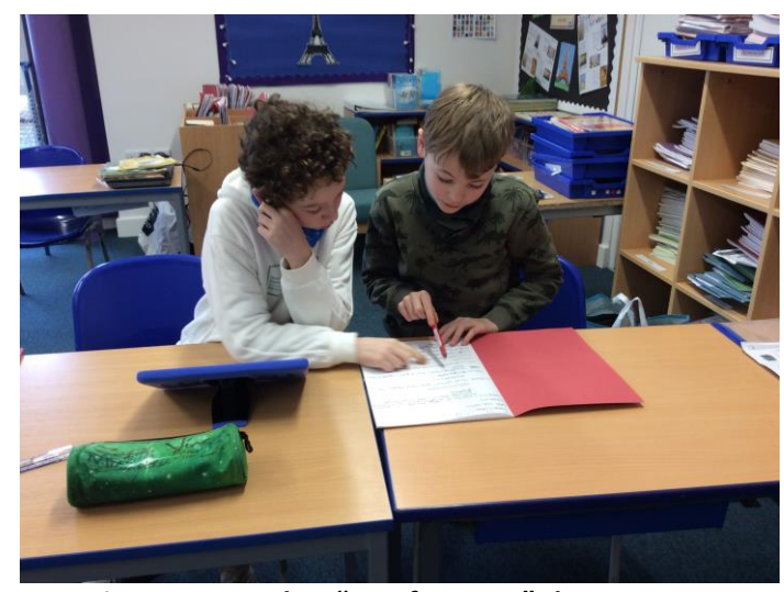
Computing connected to "Rooftoppers" the Year 6 text